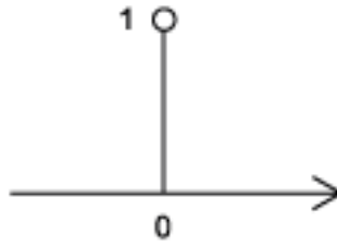
Figure 3: The graphical representation of the discrete-time impulse function

Looking at the discrete-time plot of any discrete signal one can notice that all discrete signals are composed of a set of scaled, time-shifted unit samples. If we let the value of a sequence at each integer k be denoted by s[k] and the unit sample delayed that occurs at k to be written as \delta[n - k] , we can write any signal as the sum of delayed unit samples that are scaled by the signal value, or weighted coefficients.