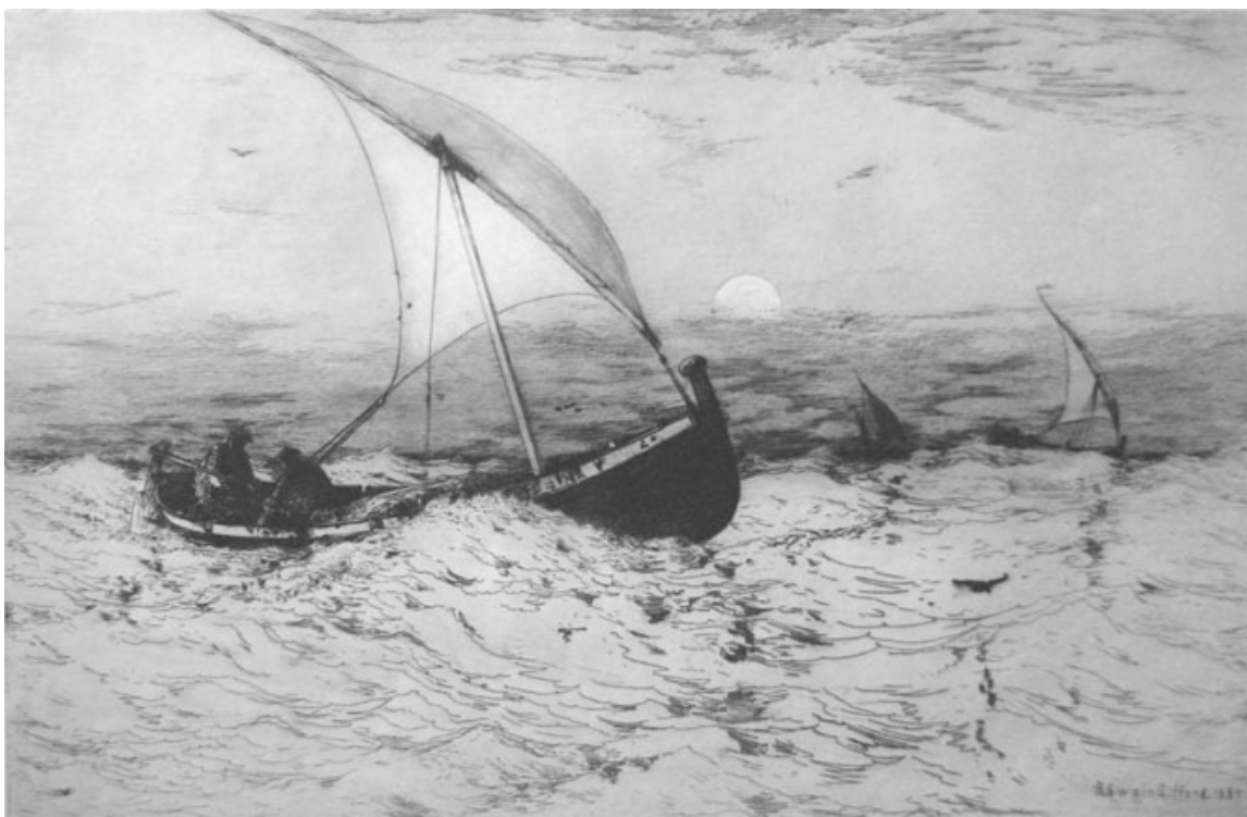
Figure 2: Robert S. Gifford, Neopolitan , 1884. (Williams Print Collection.)