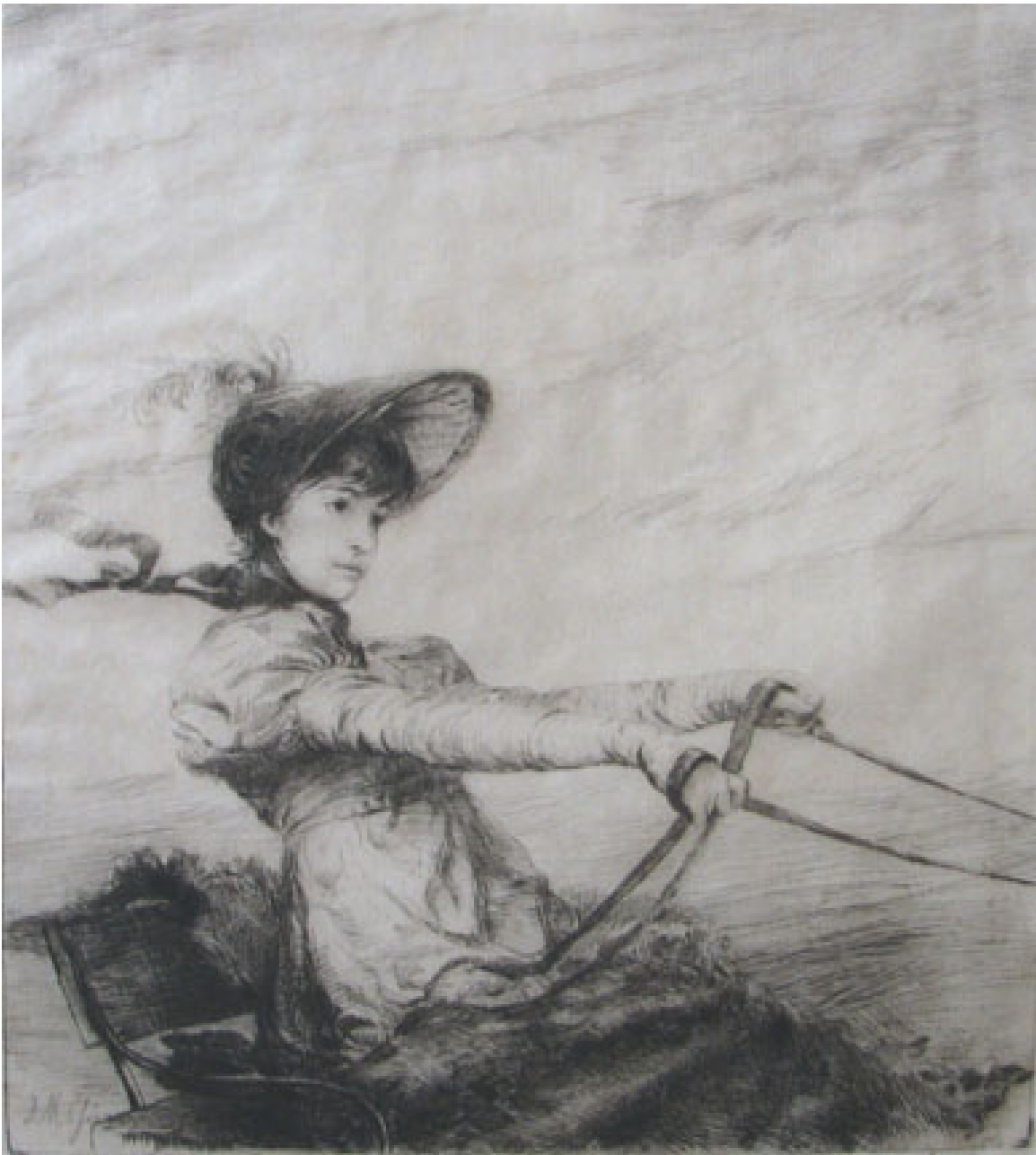
Figure 4: Ignatz M. Gaugengigl, Untitled , 1884. (Williams Print Collection.)