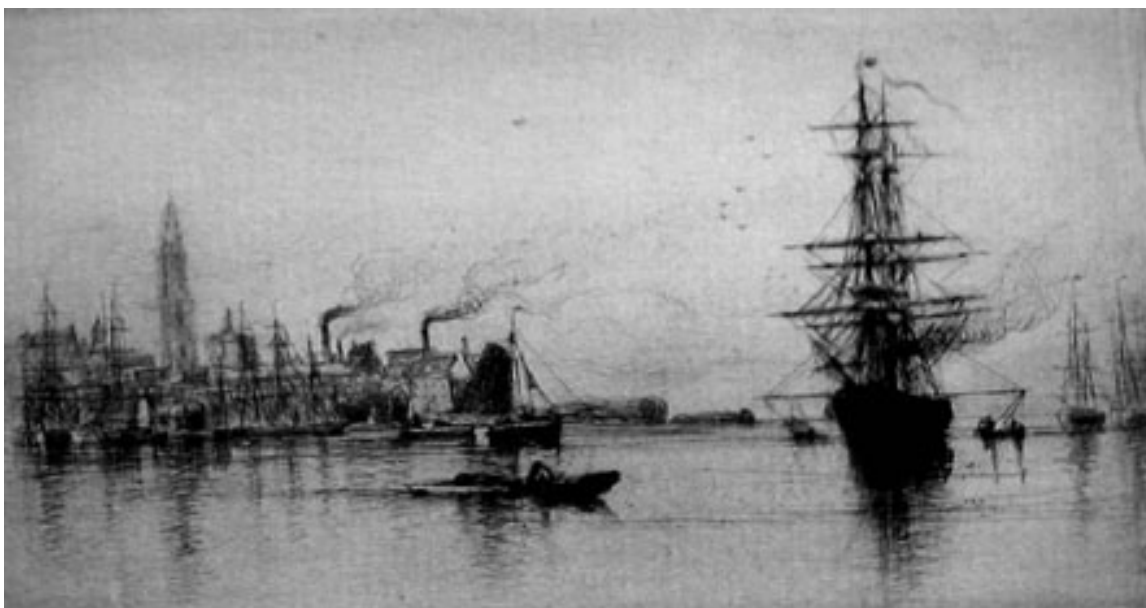
Figure 1: Samuel Colman's etching in the 1884 New York Etching Club exhibition catalogue. (Private collection.)