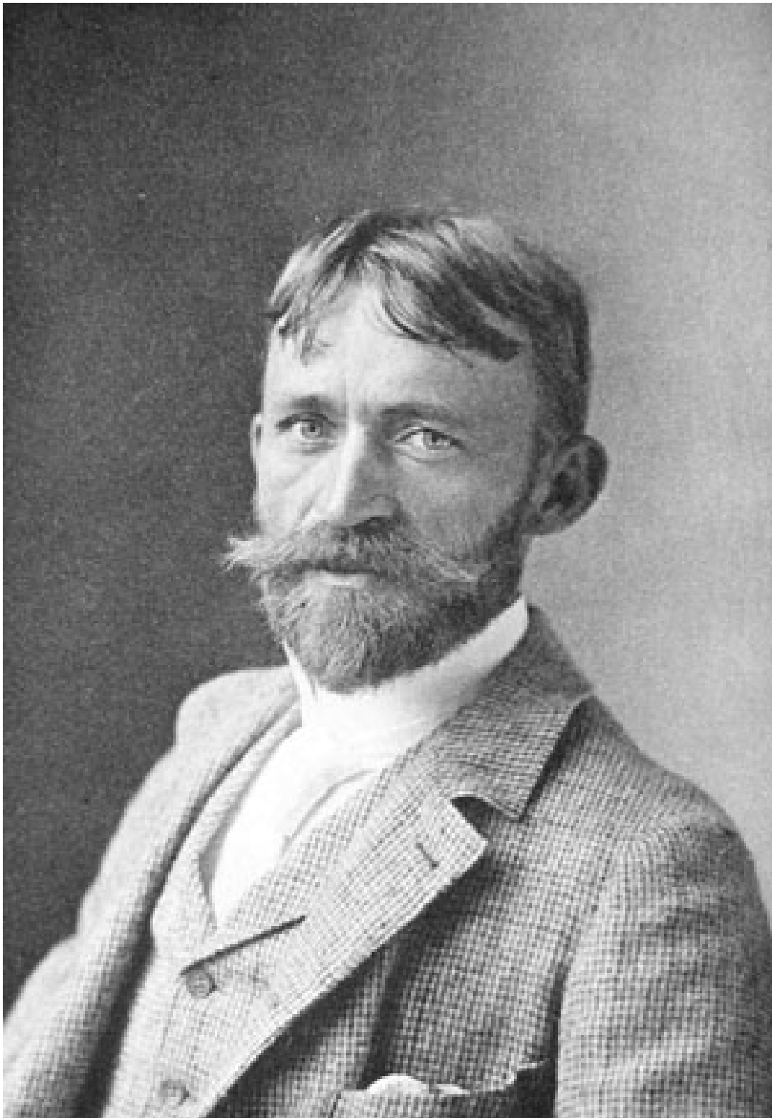
Figure 1: Photographic image of John H. Twachtman in the 1893 exhibition catalogue of the New York Etching Club.