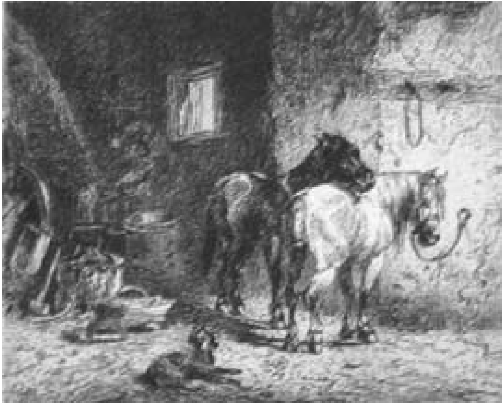
Figure 2: Peter Moran's The Country Smithy frontispiece etching in A Review of Etching in the United States, 1893 , by Henry Russell Wray. (Private collection.)