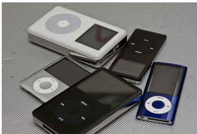
Figure 2: Engineering of technology like iPods would not be possible without a deep understanding magnetism.

All electric motors, with uses as diverse as powering refrigerators, starting cars, and moving elevators, contain magnets. Generators, whether producing hydroelectric power or running bicycle lights, use magnetic fields. Recycling facilities employ magnets to separate iron from other refuse. Hundreds of millions of dollars are spent annually on magnetic containment of fusion as a future energy source. Magnetic resonance imaging (MRI) has become an important diagnostic tool in the field of medicine, and the use of magnetism to explore brain activity is a subject of contemporary research and development. The list of applications also includes computer hard drives, tape recording, detection of inhaled asbestos, and levitation of high-speed trains. Magnetism is used to explain atomic energy levels, cosmic rays, and charged particles trapped in the Van Allen belts. Once again, we will find all these disparate phenomena are linked by a small number of underlying physical principles.