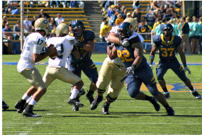
Figure 1: Momentum is an important concept for these football players from the University of California at Berkeley and the University of California at Davis. Players with more mass often have a larger impact because their momentum is larger. For objects moving at relativistic speeds, the effect is even greater.

In classical physics, momentum is a simple product of mass and velocity. However, we saw in the last section that when special relativity is taken into account, massive objects have a speed limit. What effect do you think mass and velocity have on the momentum of objects moving at relativistic speeds?